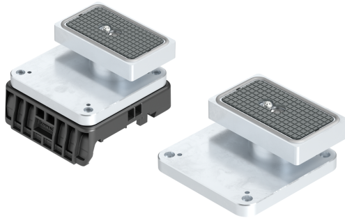
Vacuum Blocks VCBL-S6-HD